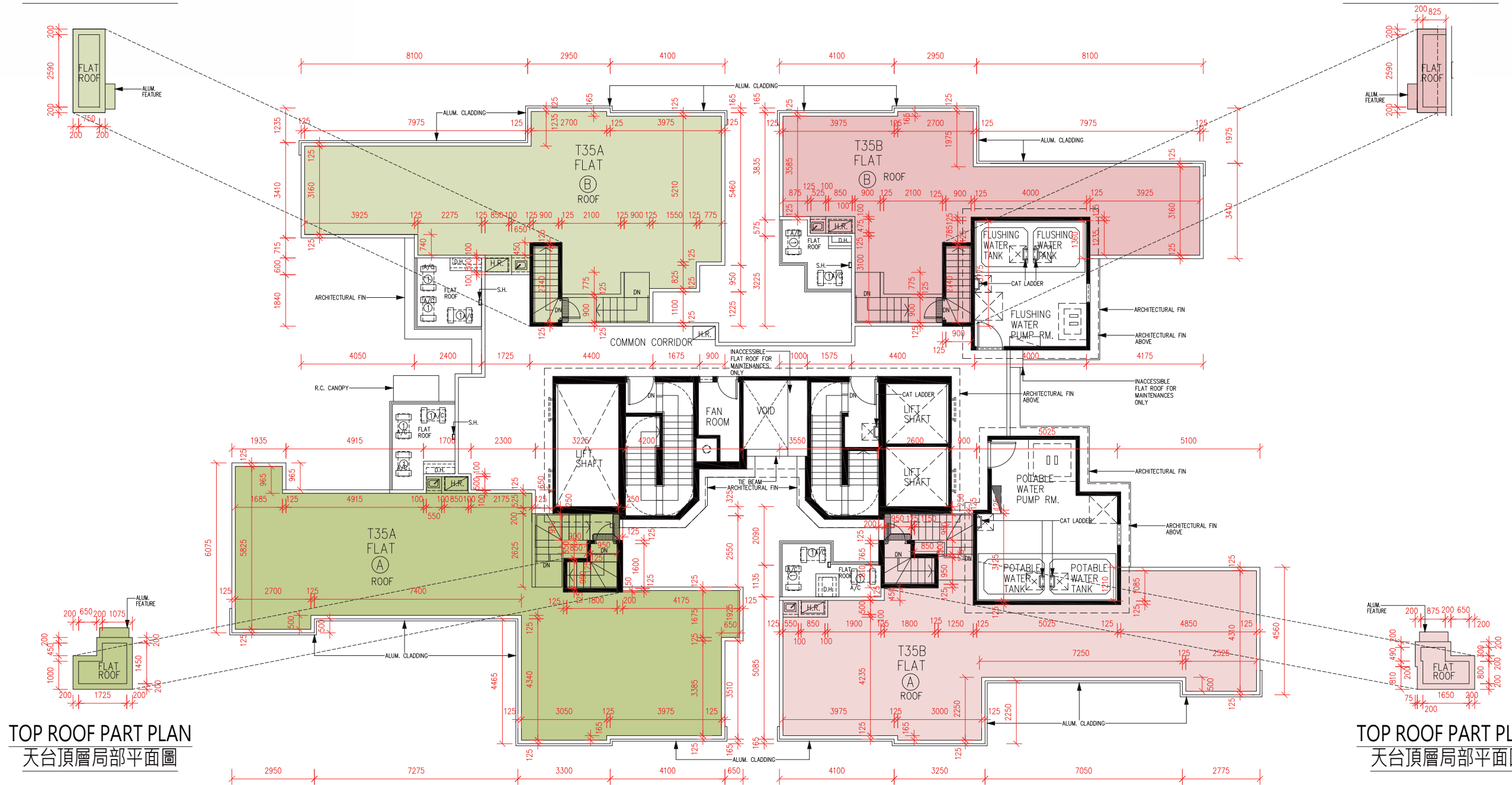
TOP ROOF PART PLAN 天台頂層局部平面圖