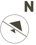
Tower 3 3/F and 5/F Floor Plan 第3座3樓及5樓樓面平面圖